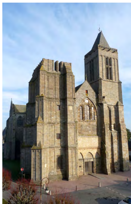
The Dol-de-Bretagne Cathedral

Deeply affected by the fire that devastated Notre-Dame on the night of 15 April 2019, Ken Follett conveyed this emotion by publishing a new short text, Notre-Dame , at Éditions Robert Laffont a few weeks later. The work has sold 113,000 copies around the world. Following up on his initial commitment, Ken Follett is donating all of his royalties for the book to the Fondation du patrimoine. Together they have chosen to allocate this money to the restoration and structural reinforcement of another cathedral, the Cathédrale Saint-Samson de Dol-de-Bretagne , supported by the Fondation du patrimoine.