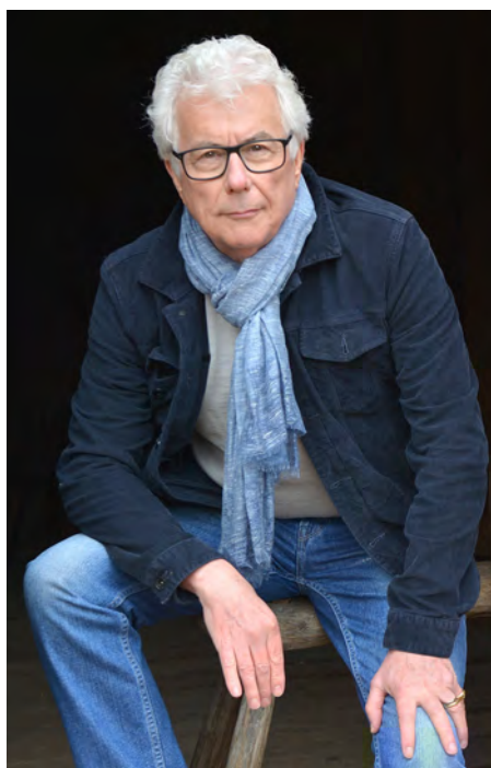
Ken Follett