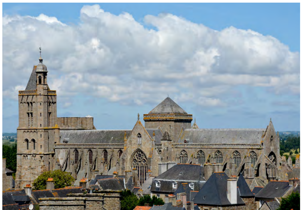
The Dol-de-Bretagne Cathedral