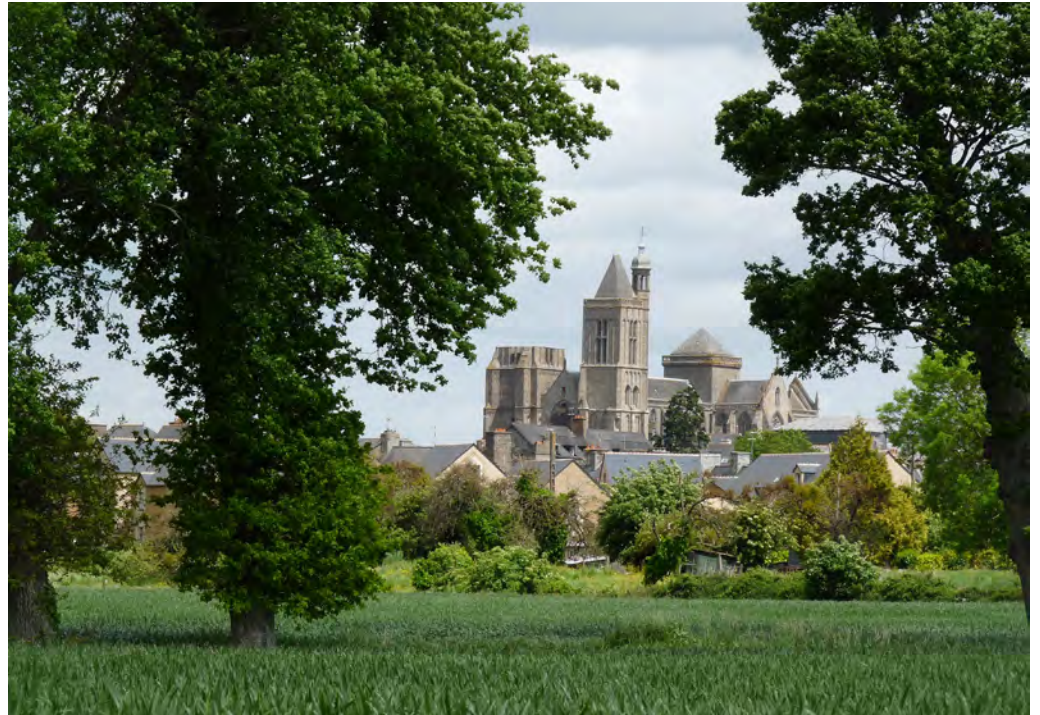
The Dol-de-Bretagne Cathedral

The presence of the cathedral is a reminder of the prestigious past of this religious Breton metropole, which was an archbishopric for three centuries and home to a line of over seventy bishops until the Revolution. The Cathédraloscope, a centre of interpretation specifically devoted to discovering cathedrals, was created in the vicinity twenty years ago. Via its interpretive exhibits and educational tools, it helps provide a better understanding of the construction of these edifices.